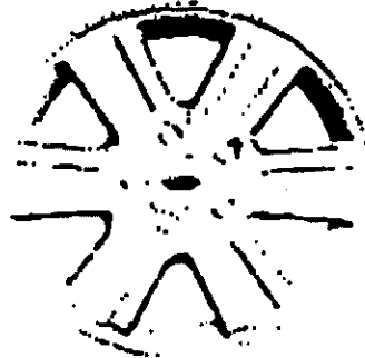
16" Machined Aluminum Wheel (Opt. XLS Sport Package/Std. XL7) (842)