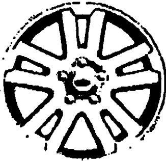
17" Painted Aluminum Wheel (Std. Eddie Bauer) (841)