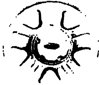
16" Styled Steel wheel (Std. XLS) (842)