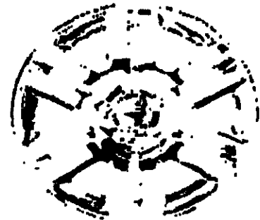
New - 18" Chromed Wheel (Opt. Eddie Bauer and Limited) (844)