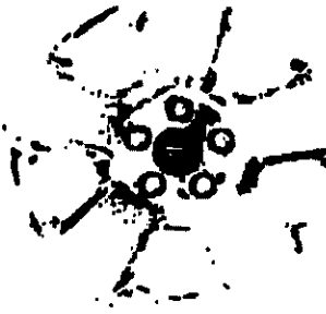
17" Chromed Wheel (Std. Limited) (843)